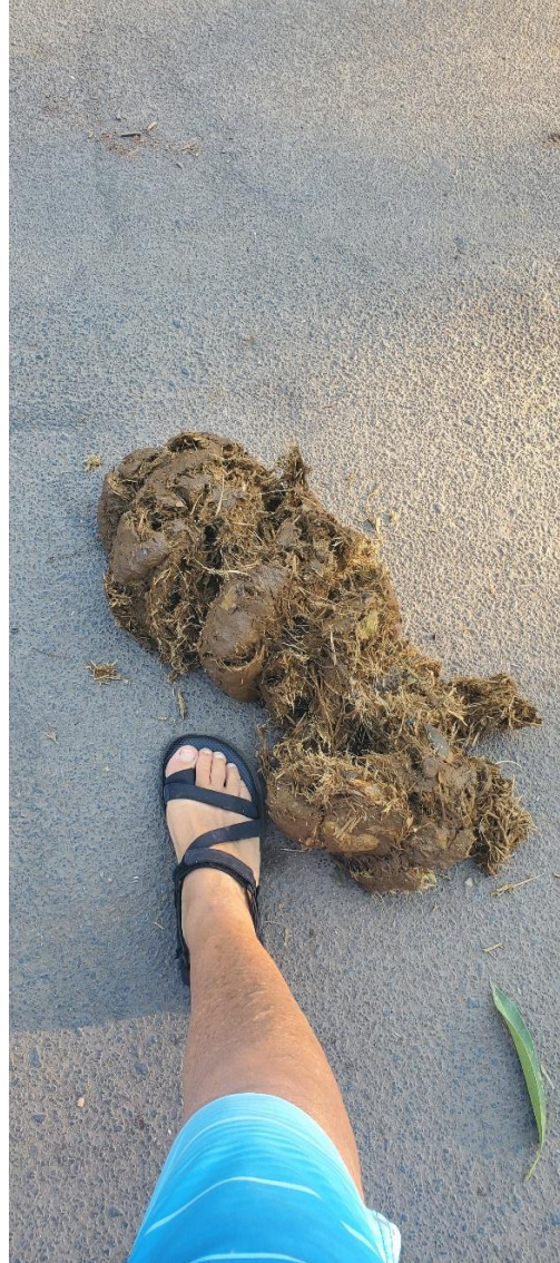
You know what

The elephants are causing great damage this year, due to lack of water and food. (drought induced) They are entering the compounds at night in search for food, and they tear down mango trees and anything else in their way, including people's vegetable patches. Several people have been killed only in the last few months. They are beautiful animals, but become very stressed from the lack of food and people throwing rocks at them! I wasn't able to ride my bicycle outside town this time due to all the elephants.